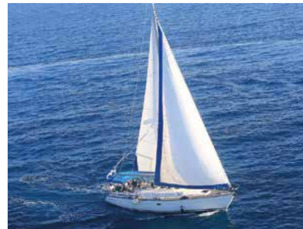
The 2019 Falken "Sette Giugno" Pozzallo Cruise marks the official launch of Sailing Yacht VITA

Up to a few months ago sailboat Ceyar was one of the boats used for the trafficking of human lives in the Mediterranean before it was eventually seized in the territorial waters of Syracuse.